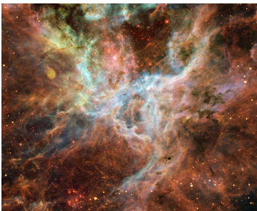
MIT Society of Physics Students Outreach

Astronomers use line spectra like these every day to determine the atoms and molecules that make up astronomical objects, such as stars and interstellar gas. They simply match the lines they see with the lines of atoms and molecules that have already been observed. Helium was actually first discovered in a spectrum of the Sun before it was found on Earth. Soon, we may discover planets around other stars with the elements necessary for life!